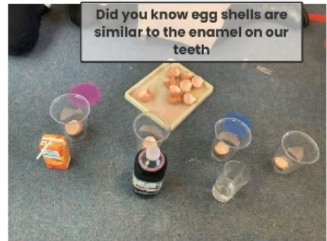
Did you know egg shells are similar to the enamel on our teeth

Science fun! We are experimenting by putting egg shells into different liquids. I wonder what will happen?