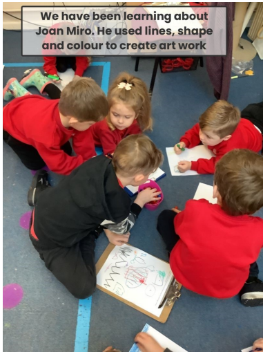
We have been learning about Joan Miro. He used lines, shape and colour to create art work

As 2023 gets off to a flying start, we celebrate the learning taking place at our wonderful school.