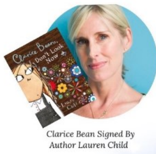
Clarice Bean Signed By Author Lauren Child